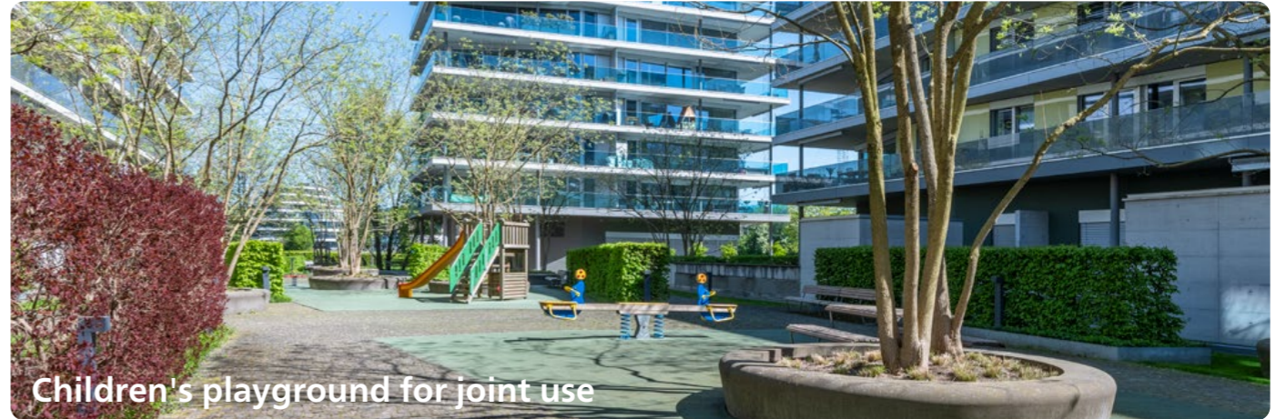
Children's playground for joint use