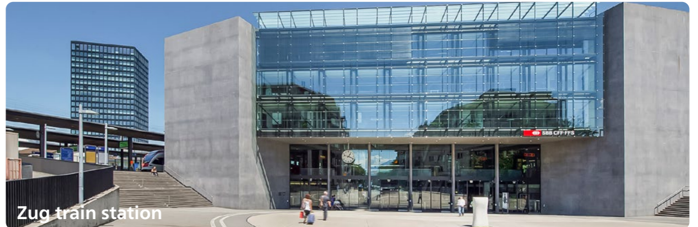
Zug train station