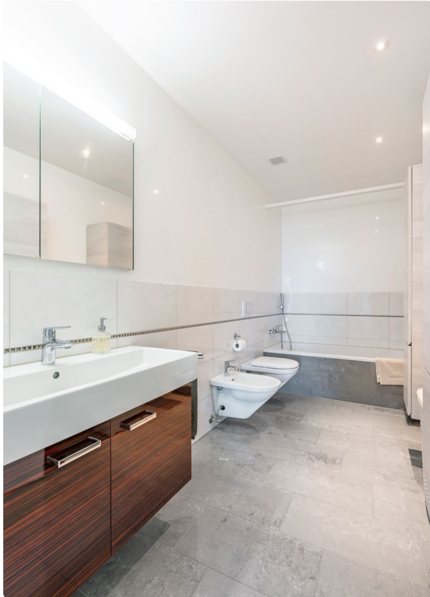
Bad 2 – elegant and with top quality materials