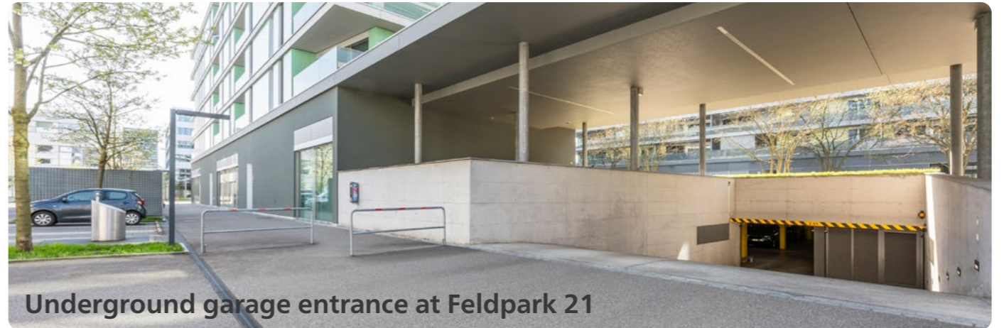
Underground garage entrance at Feldpark 21